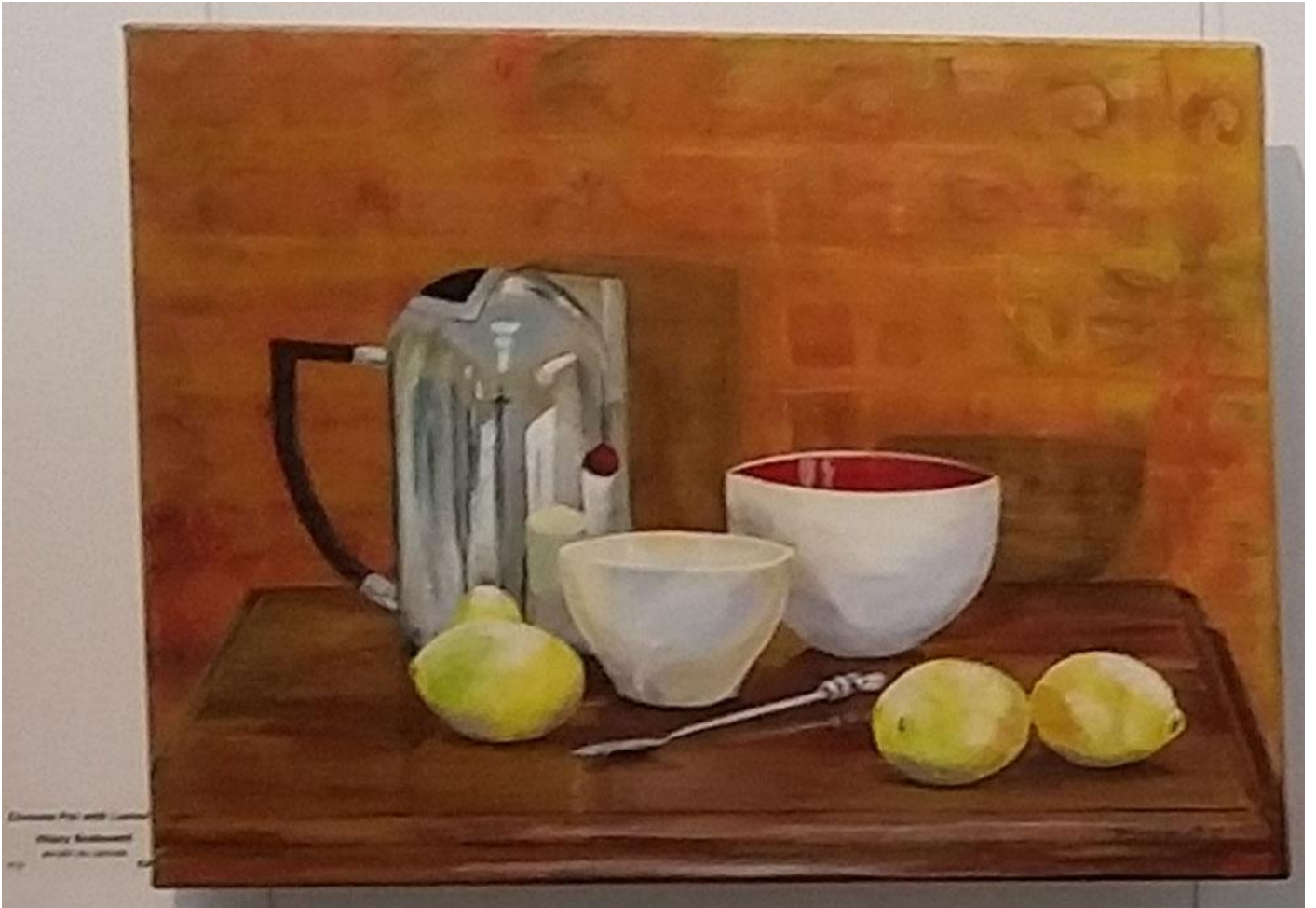
STILL LIFE WITH LEMONS 2017